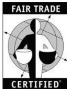
Figure A-1 Fair Trade Symbol