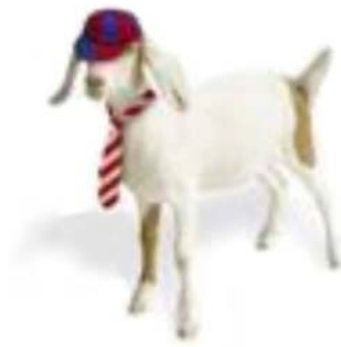
Figure A-3 Oxfam Goat